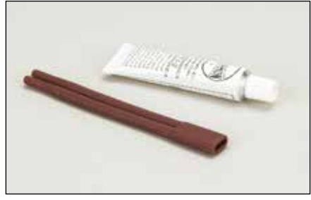
TBX-3LC , TBX-4LC power connection boots are used to prepare heating cable for connection to power. Kit includes rubber boot and RTV adhesive.