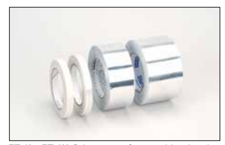
FT-1L, FT-1H fixing tapes for attaching heating cable to piping every 12" (30 cm) or as required by code or specification.

B-21 for pipes up to 21" (530 mm) diameter