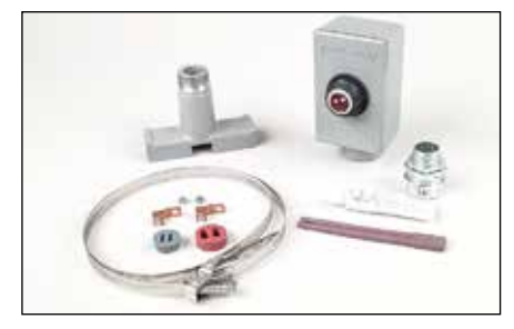
VIL-4C is designed to provide visual indication of an energized heating circuit. 120 Vac (option 1), 208 Vac (option 4), 240 Vac (option 2) or 277 Vac (option 3).

ECT-2-SR .....BSX, RSX, HTSX, KSX, VSX ECT-2-ZN .....FP, HPT