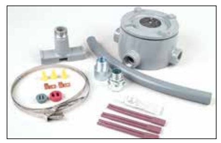
ECT-2 is designed for connecting three heating cables to power or for splicing three cables together.

ECA-1-SR.....BSX, RSX, HTSX, KSX, VSX ECA-1-ZN.....FP, HPT