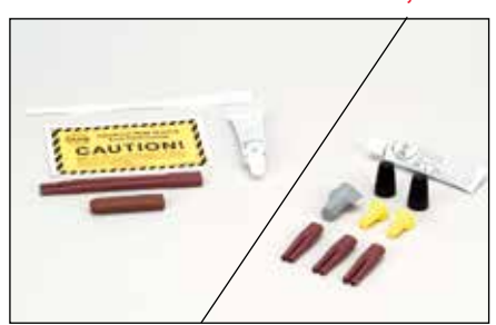
PETK circuit fabrication kit includes a power boot, end cap, RTV adhesive.

SCTK splice connection/termination kit includes a power boot, wirenuts, RTV adhesive.