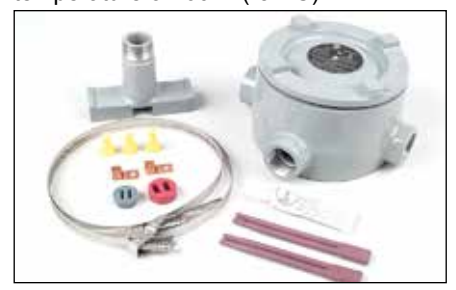
ECA-1 is designed for connecting one or two heating cables to power or for splicing two cables together.

Thermon metallic accessories utilize epoxy-coated aluminum junction boxes and expediters and are approved for ordinary and Division 2 hazardous locations. The kits have a maximum pipe exposure temperature rating of 482°F (250°C) with a minimum installation temperature of -60°F (-51°C).