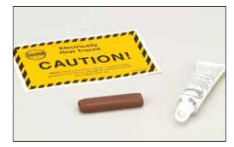
ET-6C, ET-7C, ET-8C end termination kits are designed to properly terminate the end (away from power) of a heat tracing circuit. Each kit includes a rubber end cap, RTV adhesive and caution label.