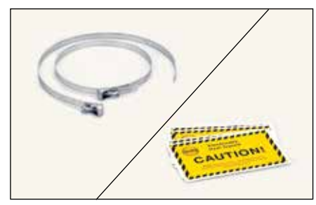
CL vinyl-based peel and stick caution labels are intended for direct exposure to industrial environments. Electrically heated pipelines and vessels are to be clearly identified at frequent intervals. Caution labels should be placed at 10'-20' (3-6 m) intervals or as required by code or specification.

TB-4F 4-point-rated 30A @ 250 Vac, 26 - 10 AWG