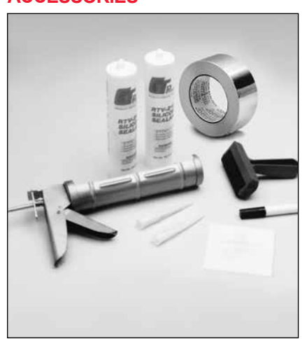
RTM Mounting Kit: Provides the materials and tools necessary to install RT FlexiPanels. Kit includes adhesive with applicator, spreader, roller and attachment tape. One kit will facilitate the installation of up to 7500 cm<sup>2</sup> of heating panel.