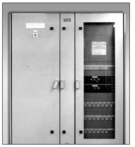
Power Distribution: For heating applications involving multiple tank or vessel heating circuits or where FlexiPanels will be used in conjunction with electric pipe heat tracing, Thermon can provide complete power distribution and control panels. These panels can be custom-designed to meet the specific requirements of an application, including enclosure type and control and monitoring capabilities. Contact Thermon for complete information.