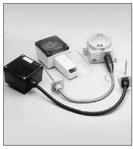
Control Thermostats: Thermon offers a complete line of mechanical thermostats and electronic control and monitoring modules designed and approved specifically for electric heat tracing applications.