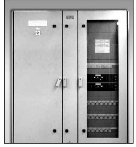
Power Distribution: For heating applications involving multiple tank or vessel heating circuits or where FlexiPanels will be used in conjunction with electric pipe heat tracing, Thermon can provide complete power distribution and control panels. These panels can be custom-designed to meet the specific requirements of an application, including enclosure type and control and monitoring capabilities. Contact Thermon for complete information.

Control Thermostats: Thermon offers a complete line of mechanical thermostats and electronic control and monitoring modules designed and approved specifically for electric heat tracing applications.